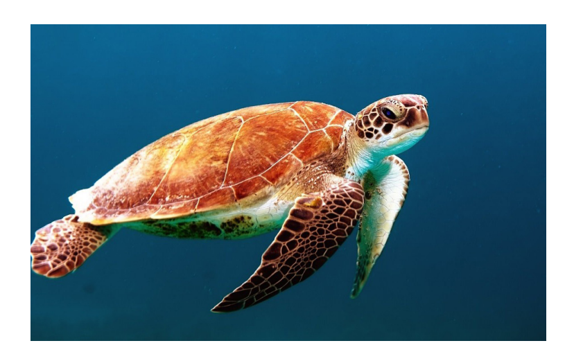
* Loss of breeding ground *Effect on sex distribution (temperature during gestation determines sex of babies and warmer temperatures increase female population while it decreases the male population)