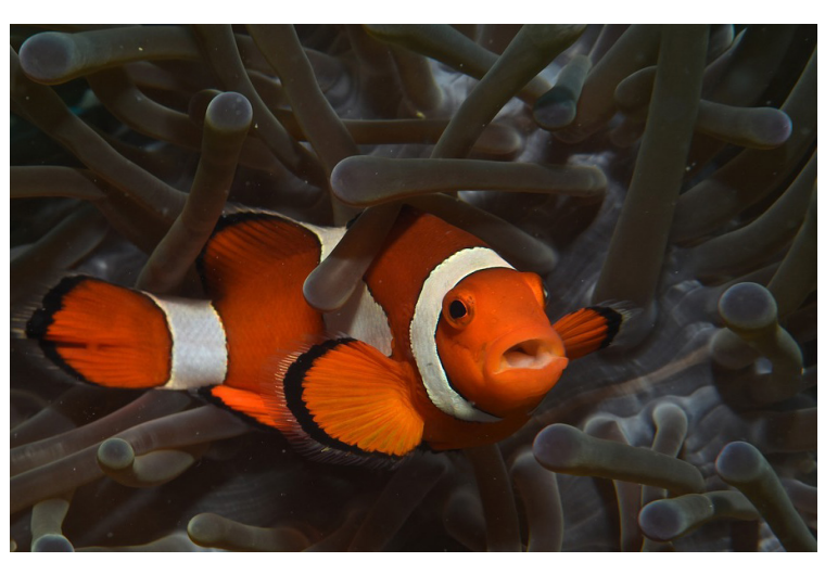
* Loss of habitat (coral)