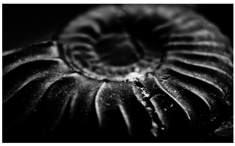
*Inability to effectively build and sustain its shell (the shells, which offer protection and a home, dissolve over time)

* Base of food chain for many aquatic animals * loss of population